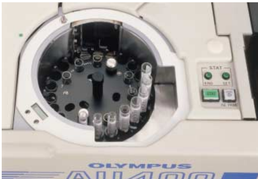
Cooled rotor for STAT, QC and calibrators

automatically adjusts to match the dispensed volume. Safety features include clot detection and crash prevention.