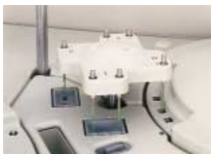
Triple washing station

Contamination is eliminated with a triple washing station. Cuvettes are washed with detergent twice and rinsed with purified water four times in each cycle. Time for mixing and cleaning steps has been reduced to 4.5 seconds.