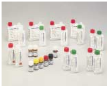
The Olympus System Reagents - an expanding range of reagents