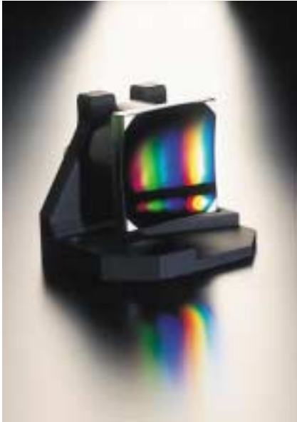
Precision due to spot photometry system

The AU 400 analyser system stands out due to the economy and high efficiency of a Random-Access System combined with effort-saving handling and an exceptional reliability: