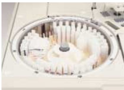
Reagent compartment for 15 ml, 30 ml and 60 ml vials