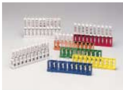
Olympus flexible racks