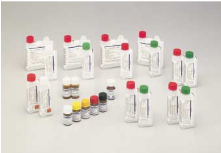
Olympus System Reagents